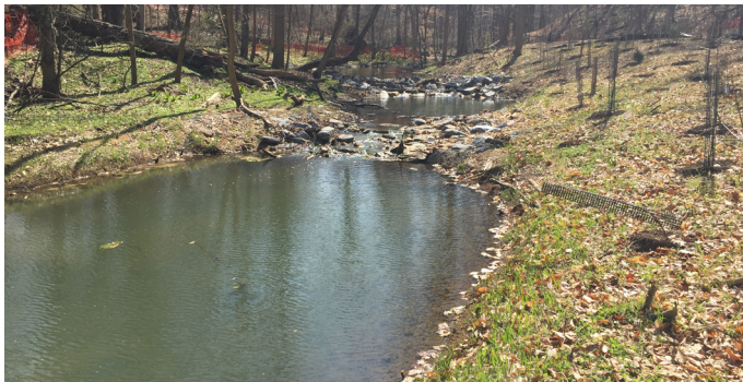
top: Initial conditions; bottom: After restoration

Restoration of the Towson Run Tributary at Cloisters established long-term, stable channel geometry along the channel network throughout the Towson Run Tributary project area, including portions of the Towson University campus. Stable channel geometry and a stream network which is