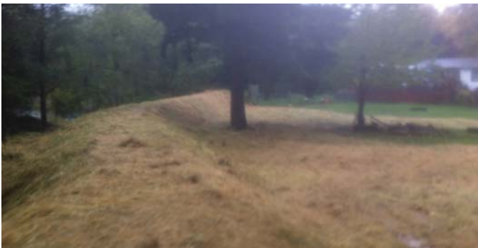
from top: During construction; Immediately after the levee was completed

The Nehalem River in northwest Oregon is host to abundant salmonids. This wild river continues to behave like a typical coastal rainforest river, as it frequently accesses its floodplain. Columbia County Soil and Water Conservation District (SWCD), working in coordination with the Oregon