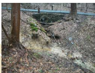
top: After restoration bottom: Initial conditions

Rock Creek Park, a favorite spot among Washington, DC bikers, hikers, birders, runners and skaters, is a natural oasis amidst a highly urbanized landscape. Administered by the U.S. National Park Service, this popular park contains many degraded streams. Biohabitats is currently helping the District Department of the Environment (DDOE) restore