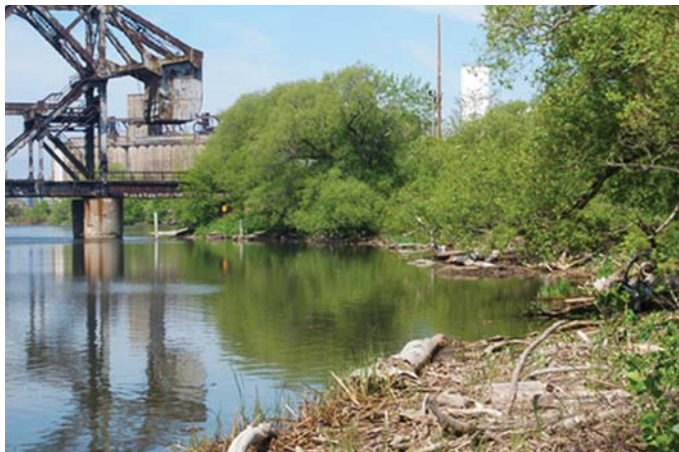
from top: Cross section of concept design; Initial conditions

Restoring the shoreline of Red Jacket Park is one of the final steps in a larger effort to improve habitat quality along a stretch of the Buffalo River that was designated a Great Lakes Area of Concern. The effort began with dredging to remove