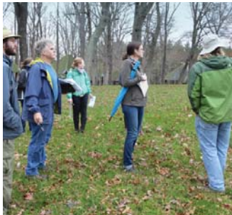
from top: The Ecological Master Plan highlights opportunities for restoration, conservation and habitat enhancement; Field assessment included a site tour with staff to understand current management protocols

The Pearlstone Conference and Retreat Center is a Jewish retreat and sustainable farm in Baltimore County, Maryland that fully integrates environmental stewardship into its operations and educational programming. When management of the entire property (which includes events pavilions, a day camp with camp sites, swimming pools, athletics fields, forest conservation easements, a pond, and wetlands) was delegated to the Pearlstone Center by the land owners, the Center's staff initiated a campus master planning process. For