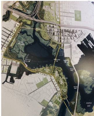
From top: Design proposals from the three design teams supported by Biohabitats; Hargreaves Jones, James Corner Field Operations, and West 8

The Parks & People Foundation (Baltimore, MD) issued a call for proposals to develop a recreation and restoration plan for the Middle Branch of the Patapsco River in Baltimore, MD. Biohabitats supported three different design teams, who were invited to prepare concepts as part of a national design competition, with our local ecological knowledge and expertise in restoration and resilience planning in the upper Chesapeake Bay.