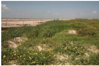
top: 50-year projected habitat shift based on estimated sea level rise and erosion bottom: Native dune vegetation

Hurricanes often have dramatic effects on barrier islands, and the impact of 2008's Hurricane Ike on Galveston Island, Texas was no exception. Yet the hurricane left in its wake a keen awareness of the need to address the consequences of such storms and their dramatic effects on the island. It also