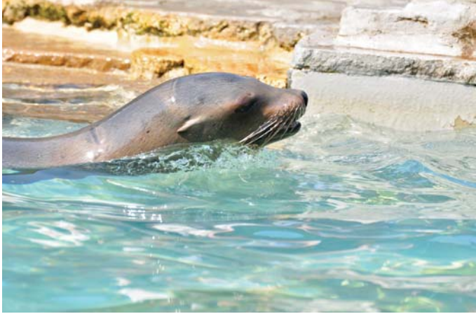
California sea lion (Zalophus californianus)

The exhibit recovers and recycles backwash from the robust life-support filtration systems that would otherwise be lost to the sewer using a natural-systems based treatment wetland.