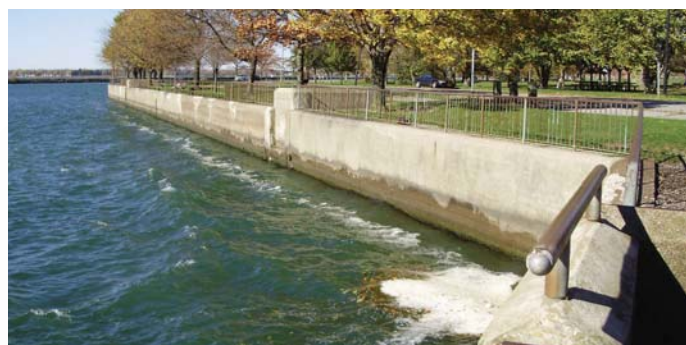
top: From seawall to living shoreline: proposed restoration at LaSalle Park bottom: Initial conditions, LaSalle Park

Biohabitats recently helped the U.S. Army Corps of Engineer's (USACE) Buffalo District in an effort to determine if a Federal Interest exists in pursuing six potential ecological restoration projects within the Lake Erie