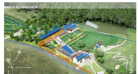
Chatham University, Eden Hall Campus