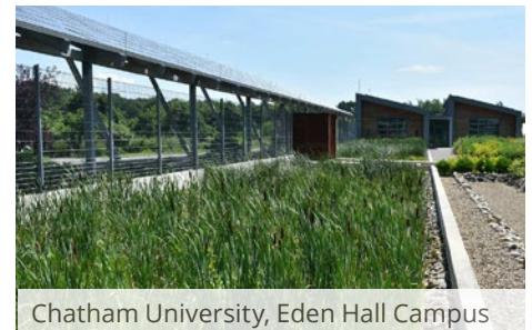
Chatham University, Eden Hall Campus