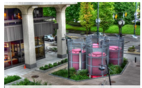
Hassalo on 8th