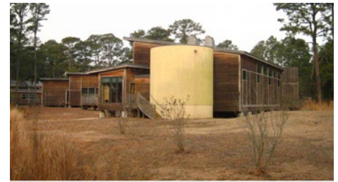
Herbert H. Bateman Ed. &amp; Adm. Center