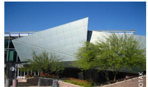
Tempe Transit Center