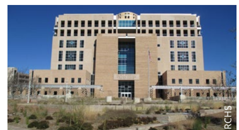
Pete H. Domenici Federal Courthouse