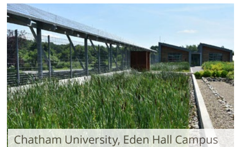
Chatham University, Eden Hall Campus