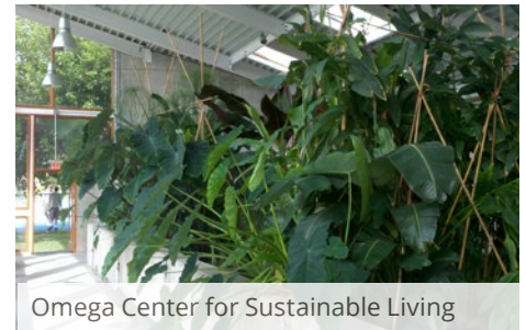
Omega Center for Sustainable Living