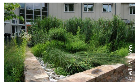
Stroud Water Research Center