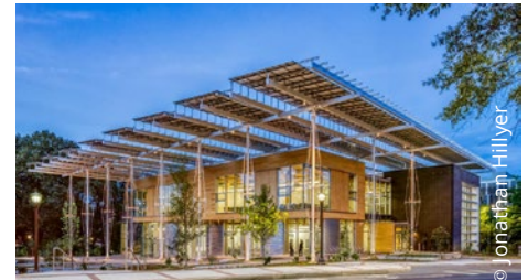
Georgia Tech Kendeda Building