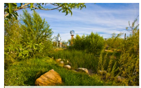
Desert Living Center