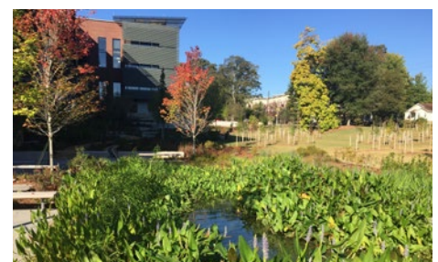
Georgia Tech Krone Building