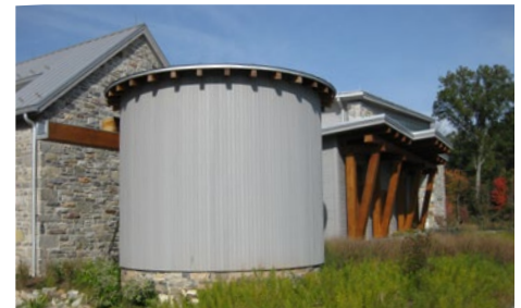
The Willow School