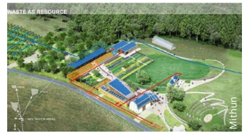
Chatham University, Eden Hall Campus