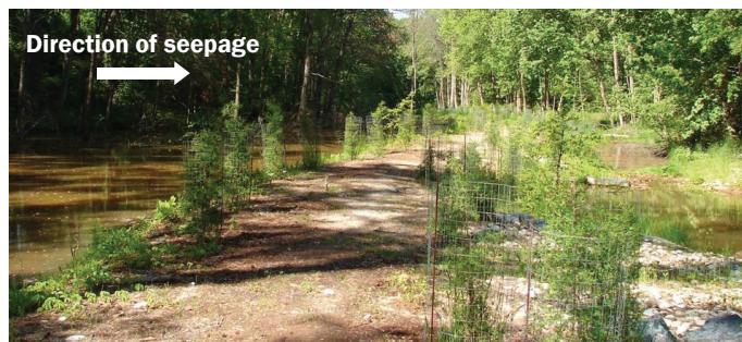
top: Typical sand seepage stormwater BMP detail bottom: Constructed sand seepage BMP

B iohabitats designed a unique sand seepage wetland BMP for the Wissahickon Valley Watershed Association (WVWA). A multipurpose trail on the Wissahickon floodplain maintained by WVWA crosses a stormwater tributary to Wissahickon Creek. Due to the trail's location on the