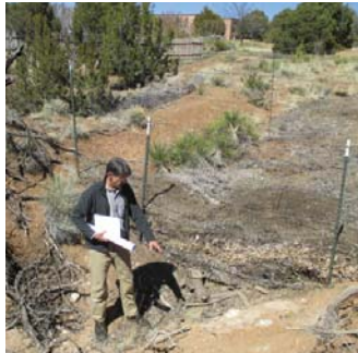
from top: Proposed stormwater management approach; Assessing initial conditions

The Santa Fe Botanical Garden is an increasingly popular destination, attracting more than 30,000 visitors a year and providing educational opportunities for the local community and beyond. Accordingly, the garden is now building a considerable expansion to their facilities: a new set of garden features called Ojos y Manos.