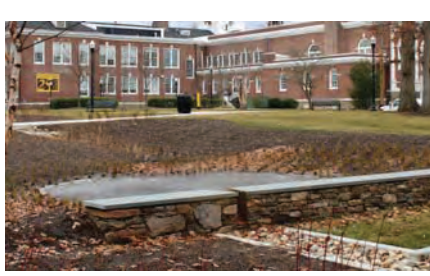
Recently completed stormwater garden and landscape upgrade

Although the master plan is a long-term planning document, it needed to address an immediate stormwater problem and be applicable to campus development projects underway. Design and construction of Memorial Hall's landscape and stormwater BMPs began simultaneously with the development of this plan. This was viewed as an opportunity to seamlessly integrate the plan's vision for improved landscape function, aesthetics, and connectivity with existing development while creating a visible path for future implementation