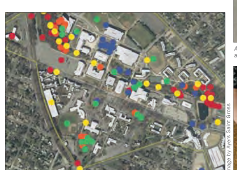
Students highlighted unsafe areas of campus,

Designs were developed collaboratively, with Rowan staff and stakeholders providing input at every stage. Concepts and landscape typologies were crafted for three 'focus areas' deemed representative of campuswide stormwater problems. With an emphasis on buildings currently under development, the concepts strengthened core open space and connectivity between north and south and restored the Chestnut Branch corridor as an east-west connection and ecological asset.