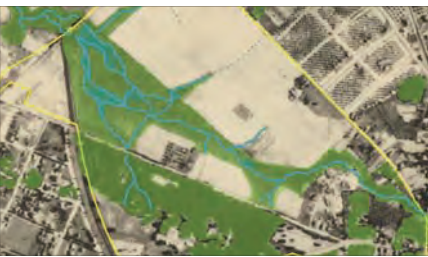
storic aerial of the property shows extensive wetlands and streams.