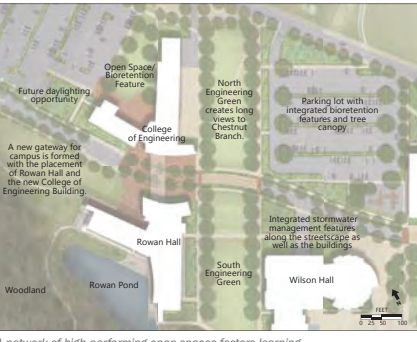
network of high-performing open spaces fosters learning d strengthens a sense of place.