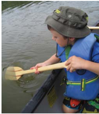
top: Stormwater swale design

Biohabitats is helping the Passaic Valley Sewerage Commission (PVSC) restore the Passaic River and its watershed and bring to life an envisioned Passaic River Blueway, a 76-mile canoe and kayak trail spanning Newark Bay. Working alongside the PVSC and local communities, Biohabitats designed six of the trail's 30 planned access points in such a way that they provide