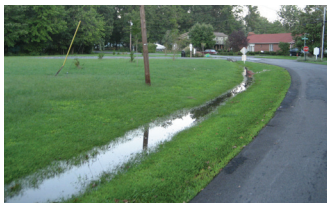
top: Map of potential retrofit locations bottom: Opportunities for conservation landscaping and swale retrofits along Creek Drive

Through an effort funded by the National Fish and Wildlife Foundation, Biohabitats developed recommendations for natural drainage retrofits and habitat enhancements for Oyster Harbor, a community located on Annapolis Neck in Anne Arundel County, Maryland. Oyster Harbor faces a number of common yet challenging management issues related to conveyance and treatment of runoff within the roadway right-of-way and on private lots. Oyster Harbor's location on the