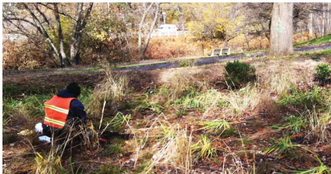
top: Thermal imagery comparing green roof with conventional (control) roof; above and right: Monitoring project sites in New York City