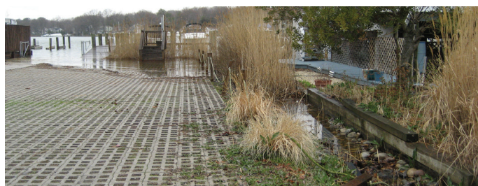
top and above: Flooding, ponding, and coastal drainage problems in Oyster Harbor, Maryland

B iohabitats is a Technical Assistance Provider to the National Fish and Wildlife Foundation (NFWF) and its partnering entities including the Bay Stewardship Fund, the Chesapeake NEMO (Network of Education and Municipal Officials) and the National Park Service. This program delivers appropriate technical assistance to both Chesapeake NEMO clients and stewardship fund grantees on an as-needed basis to quickly address challenges and