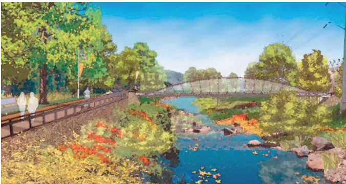
Rhodeside and Harwell, Inc.