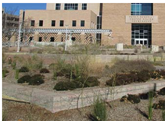
top: Rendering by Rios Clementi Hale Studios, diagram overlay by Biohabitats

To enhance overall sustainability of the seven-story Pete V. Domenici Federal Courthouse, located in Albuquerque's central business district, the General Services Administration initiated a substantial renovation to the building's three-acre landscape. As a result of this transformation, the Courthouse became one of the first projects to achieve certification from the Sustainable Sites Initiative (SITES), landscape performance-based accreditation awarded to projects that enhance local ecology.