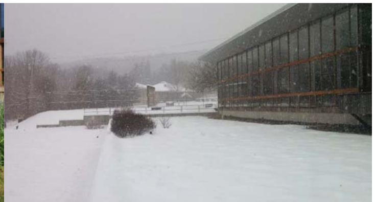
The constructed wetlands at the Omega Center for Sustainable Living in summer and winter