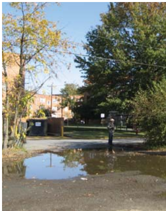
from top: Detail of design plan; Initial conditions

The city of Mount Rainier, Maryland, located only four miles from downtown Washington, DC, is known as a vibrant, pedestrian friendly community with a longstanding history of environmental stewardship. Stormwater flowing through Mount Rainier drains to the Anacostia River and ultimately, the Chesapeake Bay. Working towards a vision of citywide green infrastructure, the city initiated an effort to transform an overly wide street in need of traffic calming into a “green street.” The street is also home to a community swimming pool and the future site of a public park.