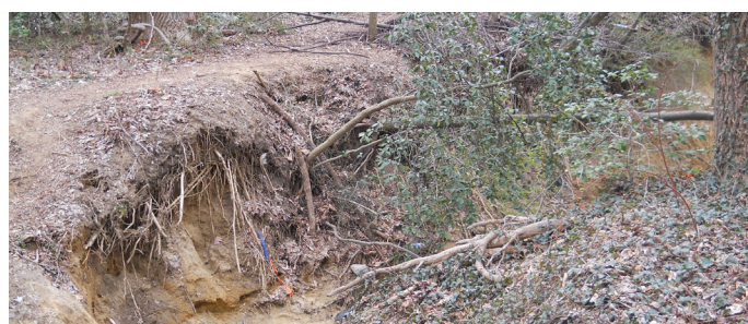
top: Biohabitats' restoration plan; middle and bottom: Initial conditions

Decommissioning a stormwater management pond and restoring an eroded outfall channel and tributary using sand seepage wetlands and regenerative stormwater conveyance will significantly reduce the nutrient and sediment loads to the Cypress Creek subwatershed.